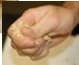
Falls apart= SAND

The large quantity of mineral particles in clay soil are so tiny and so closely packed together that they form a dense mass that is difficult for your shovel, never mind roots, water, or air to penetrate. Because water can't easily soak through clay soil, poor drainage is a major problem that causes many root balls or bulbs to simply rot in the ground. But don't be discouraged because such "rock-hard" soil can be turned into more workable loamy-type soil.