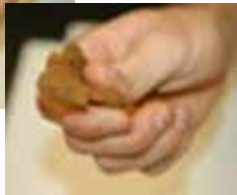
Tight ball = CLAY