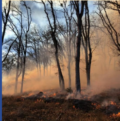
Living with Fire