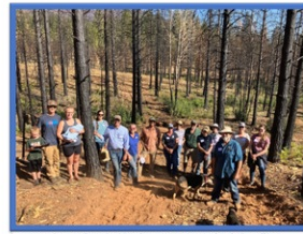
UC Cooperative Extension and Feather River Resource Conservation District staff lead landowners on a tour of private lands treated by the Flames EFRT after the 2021 Dixie Fire, October 2023.

A report to the California Wildfire and Forest Resilience Task Force June 2024