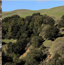
Oaks & Rangelands