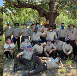
UC California Naturalist Program