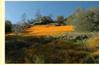
Yosemite through Merced and Tuolumne Canyons

UCCE Central Sierra Natural Resources Program and Tuolumne County Master Gardeners are helping plan, organize, and staff a native plant symposium, hosted by the California Native Plant Society Sierra Foothills