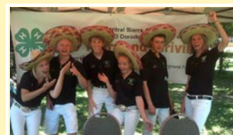
4-Hers at Chili Cook-Off

important impacts that address issues facing the community both today and into the future. We are celebrating 100 years of 4-H, by designing & leading