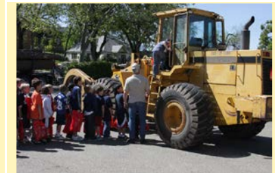
Group of 3rd Graders learning about timber equipment.

On May 14th, El Dorado County Ag in the Classroom (AITC), in partnership with UC Cooperative Extension, hosted 1001 third grade students at the El Dorado County fairgrounds for Farm Day. During this