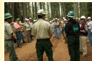
Collaboration between groups

language to support collaboration, share tools to prevent problems, and demonstrate interventions to support success when problems arise. These workshops are designed to support the building of a common knowledge base through mutual learning and discussion. UC Cooperative Extension has developed training modules for all levels of natural resource management staff and stakeholders interested in developing these skills.