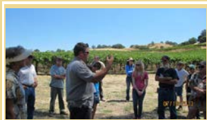
Vineyard Manager discusses canopy management

The annual CWA (Calaveras Wine Alliance) and UCCE Vineyard Tour held July 19 gave 30 growers a