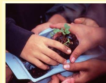
Creating & Sustaining Your School Garden

A two-part workshop for developing and enhancing School Garden Programs.