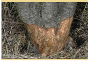
Damage to base of tree caused by voles.

Recently updated Pest Notes from the UC IPM (Integrated Pest Management) Website .