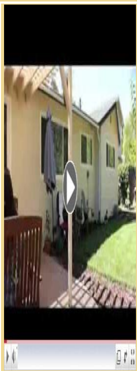
How to reduce yellowjackets around your yard

Are the deer eating everything in sight? See the Deer Pest Note , ANR publication 74117.