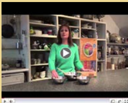
Put Me On Your Plate

happy to announce our new YouTube channel that will have videos with our staff on simple easy thing you can do to help improve your plate and your health. Our first video, Put Me On Your Kids Plate : is now available for viewing, sharing, and posting. So take a minute to view these great tips and then share them with friends and family. Small changes really can make big differences.