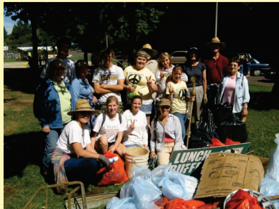
Group poses with collection of trash.

The Great Sierra River Cleanup is scheduled every year for the third Saturday in September. This year it is scheduled for: