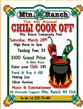
Calaveras County 4-H Mountain Ranch Chili Cook-Off