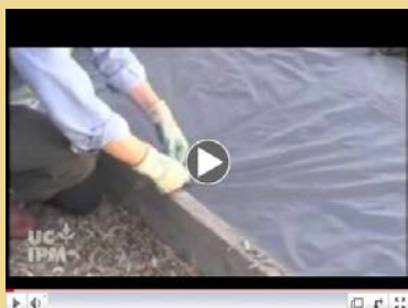
Weed control using fabric and mulch

Is your lawn suffering from pest issues? Check the Lawns and Turf pest notes for information.