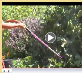
Hosing off aphids.