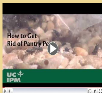
How to Get Rid of Pantry Pests

Join us for FIT+ (Forestry Institute for Teachers PLUS), a two-day workshop that provides training in K-12 environmental education and special access to guest experts and unique California sites. All participants receive Project WET certification and a FREE K-12 curriculum guide. In addition to water and forestry topics, locally relevant topics may include watershed conservation, fire ecology, urban forestry and more! The training is designed for formal and non-formal educators who work with youth.