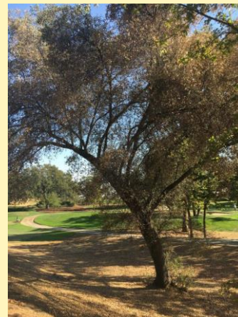
Interior live oak with foamy bark canker.

Some recent finds in El Dorado and Calaveras County have landowners concerned over their oaks. There is no question that the ongoing drought has played a significant role in the mortality of pines throughout the state. Now the oaks are showing a similar demise. A new canker disease, termed foamy bark canker has been found in multiple locations throughout the region. The disease was first identified in Europe around 2005 and was later identified in Southern California in 2012. Since its discovery in Southern California, declining coast live oak ( Quercus agrifolia ) trees have been found throughout urban landscapes across Los Angeles, Orange, Riverside, Santa Barbara, Ventura and Monterey counties. Over the past year, the disease was found further north in Marin and Napa counties. This summer the fungus was isolated from interior live oaks ( Quercus wislizeni ) off Hwy 49 in El Dorado County and more recently from interior live oaks at a golf course in Calaveras County.