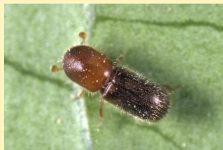
Western Oak Bark Beetle.

The disease is spread by the western oak bark beetle ( Pseudopityophthorus pubipennis ). Native to California, the small beetle (about 2 mm long) is reported throughout California from the coast to the western slope of the Sierra Nevada and Cascade Range. It is common on various oaks, including coast live oak, interior live oak, California black, and Oregon white oak, but has also been reported on tanoak, chestnut and California buckeye. The beetles colonize trees or parts of