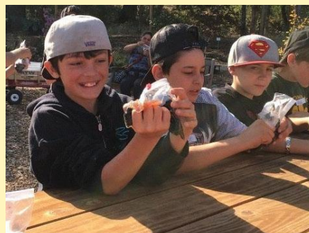
Kids crushing grapes at the Sherwood Demonstration Garden

Several dozen fifth and sixth-grade students made the trip from Georgetown to visit the Sherwood Demonstration Garden and Wakamatsu Tea and Silk Colony Farm in Placerville for a day of unique healthy living