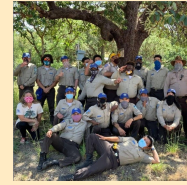
UC California Naturalist Program