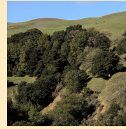
Oaks & Rangelands