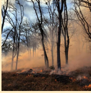
Living with Fire