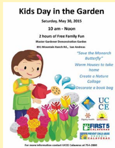
Calaveras County - May 30