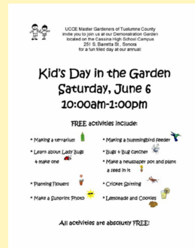
Tuolumne County - June 6