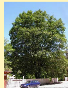
California Black Oak. Copyright © 2011 The Regents of the University of California. All Rights Reserved.

National Arbor Day was April 24. With California's continuing drought, many trees are showing signs of water stress. UC Agriculture and Natural Resources tree experts have been hearing from homeowners who are concerned about the effects of the drought on valued oak trees in their landscapes.