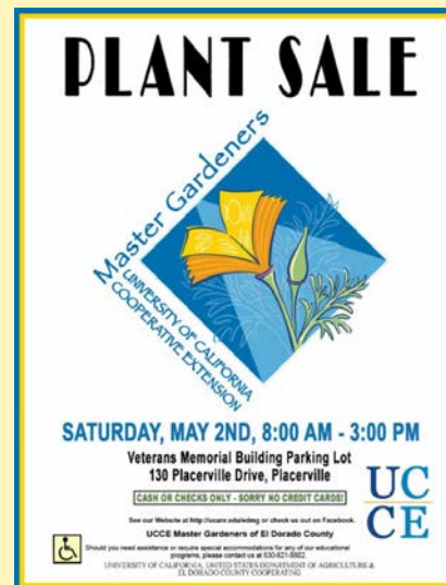
Click flyer for webpage.