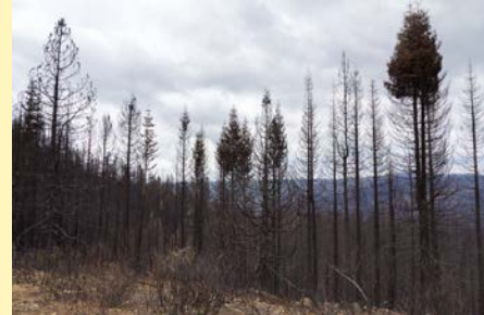
King Fire Damage

Over a dozen UC Agriculture and Natural Resources (UC ANR) California Naturalists, fire ecology experts, wildlife biologists, resource managers, educators, and artists met at UC Berkeley's Blodgett Forest