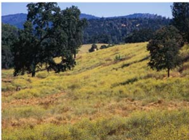
Yellow starthistle growing in a field in Calaveras County.

In April 2021, scientists released a new weevil from the Mediterranean region of Europe at the Bureau of Land Management Magnolia Ranch day use area in El Dorado County, CA to join the battle against yellow starthistle.